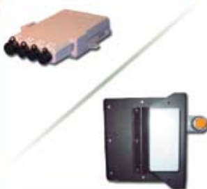
ContainerSafe & Xpress