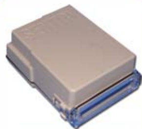
SENTRY Extended Pack